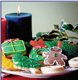
PYC Fundraiser Cookie Walk Dec 12 - 11:15 am

This is always a great way to begin the Advent Season as we wait and hope for the coming of Christ, the light of the world.