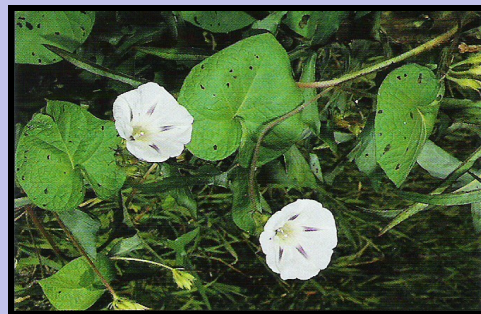
COMMON MORNING GLORY