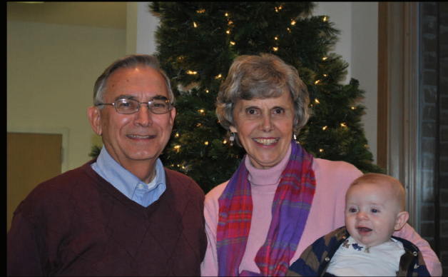
Advent Festival Christmas Pageant