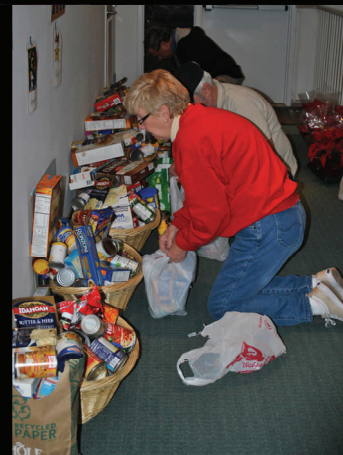
Annual Christmas Project Gift Sorting