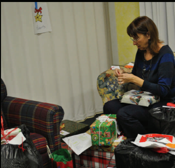
Annual Christmas Project Gift Sorting